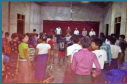
Thirteen were saved and baptized in the first week of services.