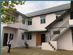
Hope Baptist Church just outside of Yangon, Myanmar