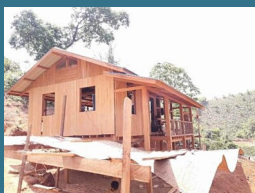
The second church building in Rakhine State is progressing.