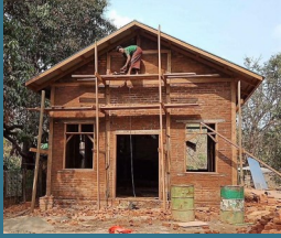
The first church building in Rakhine State was dedicated.