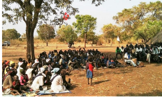
A church meeting under a tree in Camp Sherkole

The four Timothy Project pastors also have the additional burden to help their congregations who intend to stay together when they return to their villages.