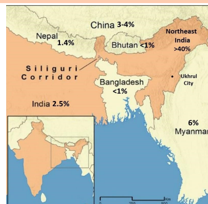
Percentage who embrace Christianity in and around NE India

There is hope. The Spirit of God is moving. In 1911, less than 2% of the people of northeast India called themselves Christian. Today, about 40% embrace Christianity and a few thousand Baptist churches have been planted. These churches are aggressively trying to reach people in their region with the Gospel.