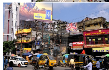
Siliguri rests at the foothills of the Himalayas