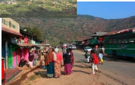
Ukhurul is a rural mountain city

In Siliguri: There is an interesting opportunity to sponsor periodic "deputation seminars" to train Bible school graduates in how to share their missionary call with established Baptist churches in India. Through this training and subsequent deputation, these men will be fully supported by Indian churches to go into various Indian states and neighboring countries as evangelists and church planters.