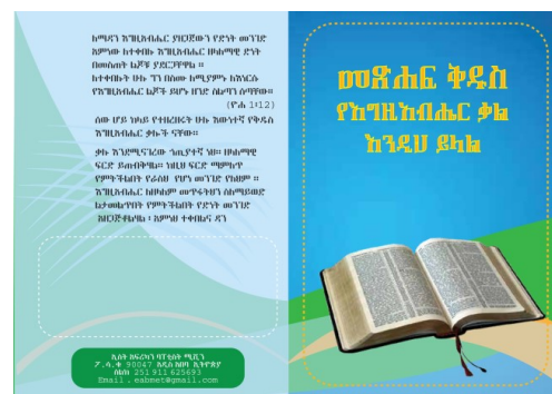
The outside panel of the Amharic tract

Through a gift from Campus Church, Pensacola FL we were able to help East Africa Baptist Mission (EABM) prepare and print 100,000 gospel tracts in four languages. They will be distributed to churches across Ethiopia and South Sudan beginning this month.