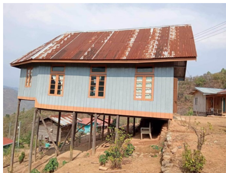
Pictured: Hmunpi Revival Baptist Church building

The Lord protected the Christians and their property. The junta's army withdrew and the area is peaceful again.